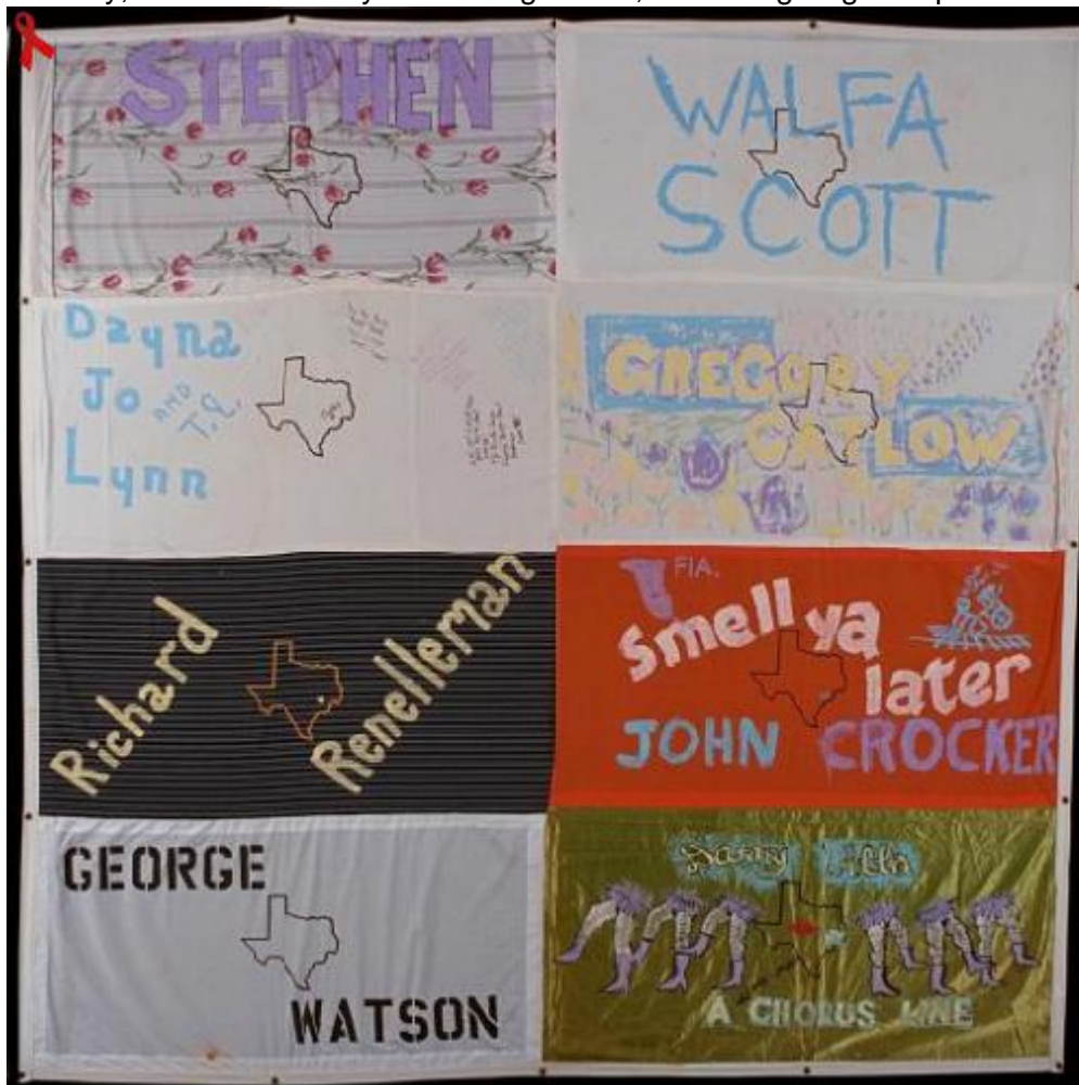
Names on Block #120